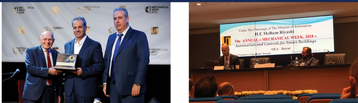
Nakhoul Corporation among the exhibitors during The Annual "mechanical week, 2018" Automation and Controls for Smart buildings at the OEA- Beirut